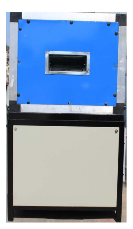
Industrial Fresh Air Dehumidifier